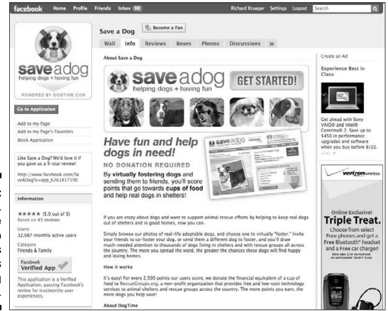
Figure 12-7: DogTime. com's Save a Dog app lets players earn points while saving dogs.

Many businesses are starting to take advantage of the Facebook Platform and creating customized apps, also known as branded apps. They can be developed relatively inexpensively and are a good way to get exposure for a company if the app goes viral, spreading to many members. From large media companies, such as MTV and CNN, to small nonprofit organizations, such as Save a Dog (see Figure 12-7), which has more than 32,000 monthly users, companies big and small are creating customized apps to get in front of their Facebook community.