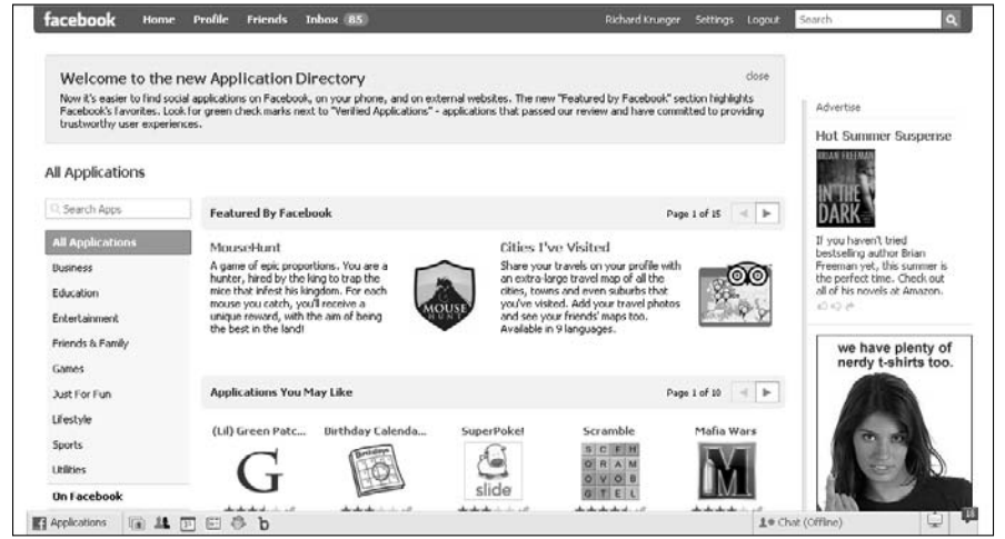
Figure 12-2: You can search for apps in the Application Directory.

The bottom half of the directory is the Recent Activity from Friends section, which shows stories generated by the apps at key points of your friend's interactions (for example, filling out a survey) leveraging the Facebook News Feed technology. Stories that your fans see on their Home page let them discover new apps that their friends are using.