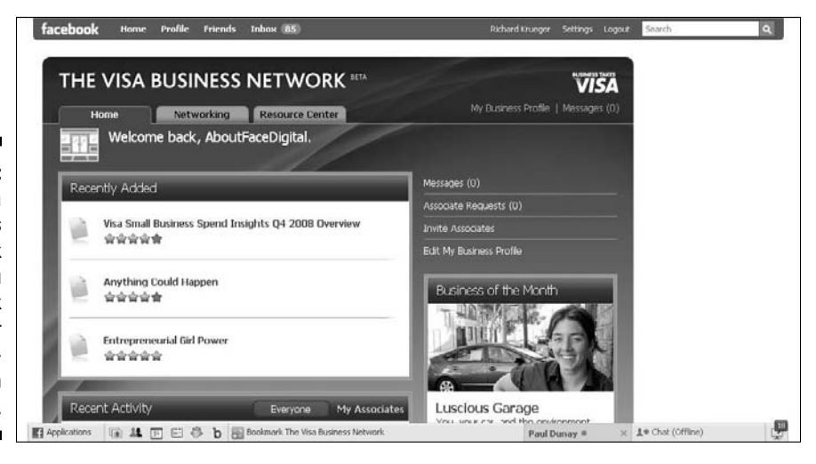
Figure 12-1: The Visa Business Network lets you network with other professionals within Facebook.

For a list of our favorite business apps, see Chapter 19.