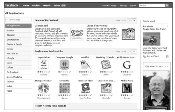
Figure 12-8: Facebook provides ample resources for application developers.

If you're thinking about creating a customized app, whether you develop it yourself, work with an independent developer, or work with an app development studio, it's good to review the Facebook Developers page. For experienced developers, plenty of tools are available, including PHP Client Libraries, Debugging Tools, and information on various Hosting Services. (See Figure 12-8.)