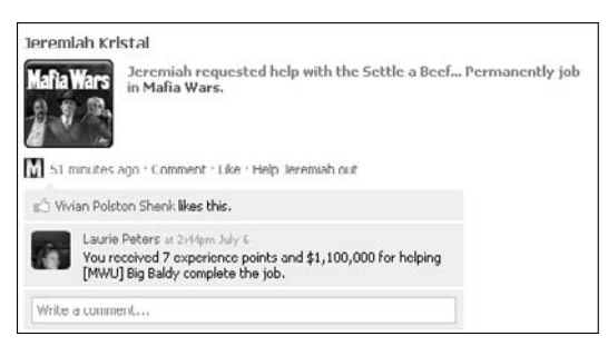
Figure 12-5: Facebook applications that generate news stories can leverage the viral effect of the social network.