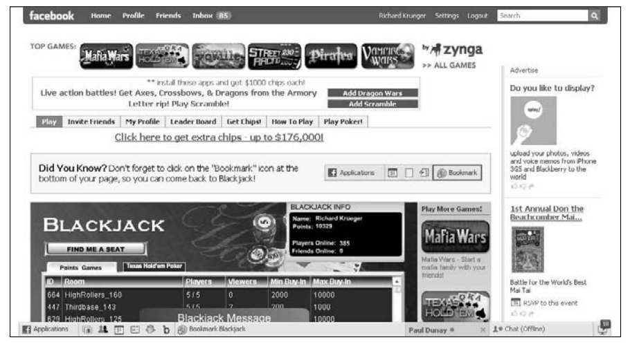
Figure 12-6: Some applications carry ads to incentivize you to download other applications.

Application advertising is a good way to ensure that a particular branded app gets enough installs, which in turn, generates News Feed stories and fuels viral growth. If you're willing to pay $1.00 per install on 50,000 users (a $50,000 ad budget), the amplified effect of attracting new users could significantly lower your total cost per user (CPU).