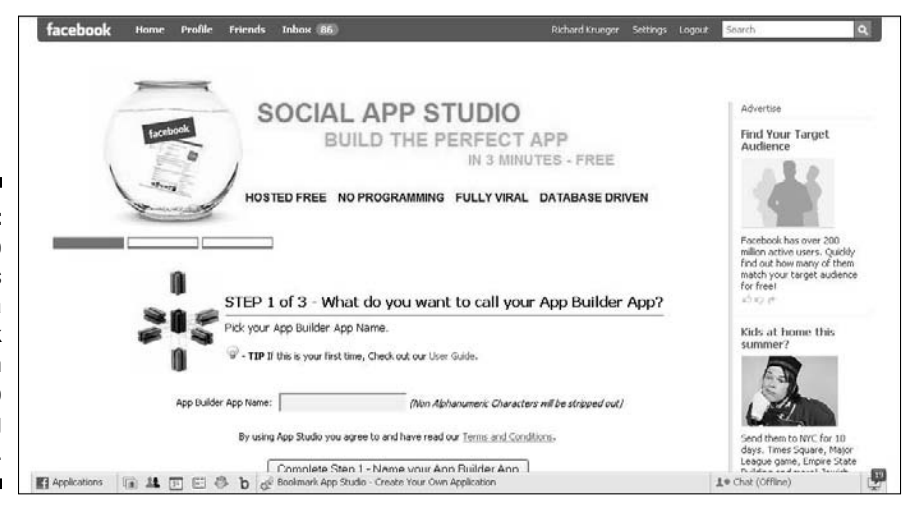
Figure 12-9: Social App Studio lets you build a Facebook app with little or no programming knowledge.

the Facebook Application Directory, brings a template approach to some of the most popular types of apps, such as gift giving.